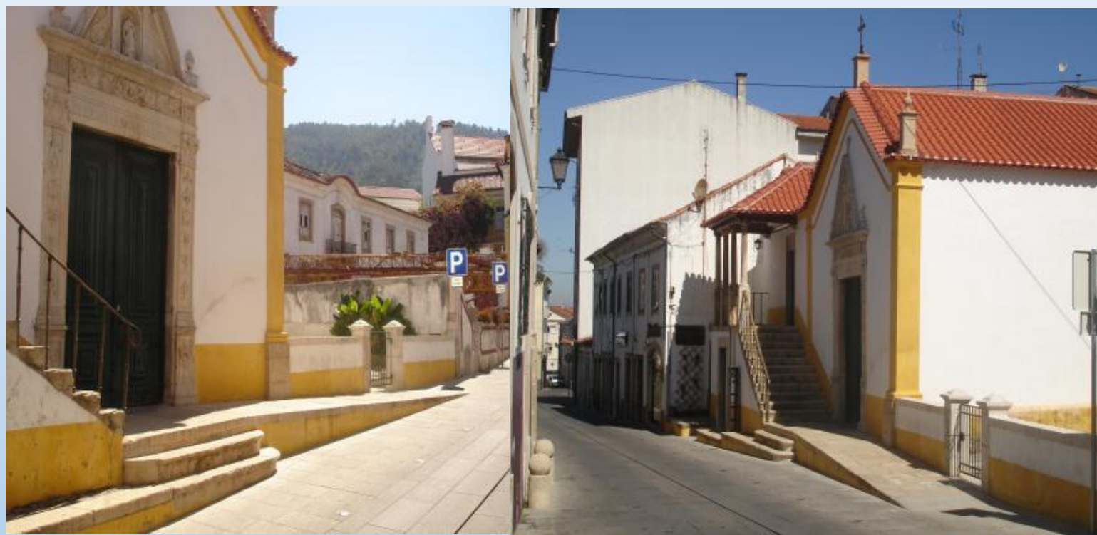
Viscondessa do Espinhal Street – Lousã