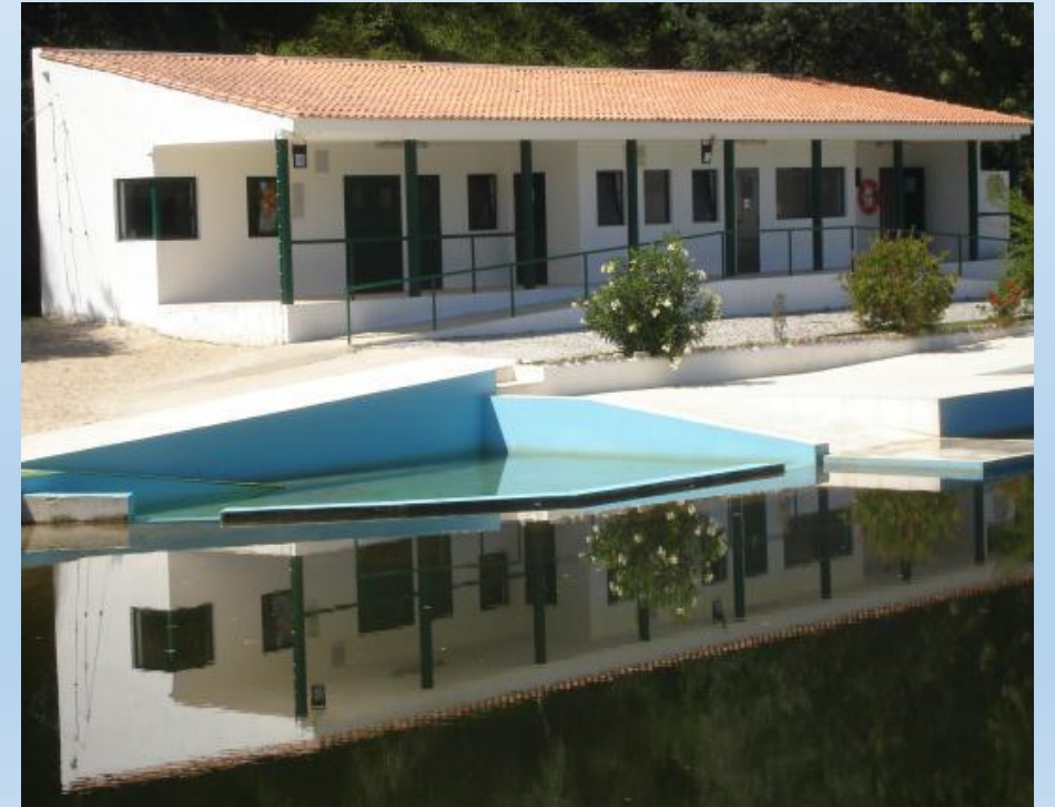
Senhora da Graça River Beach - Serpins