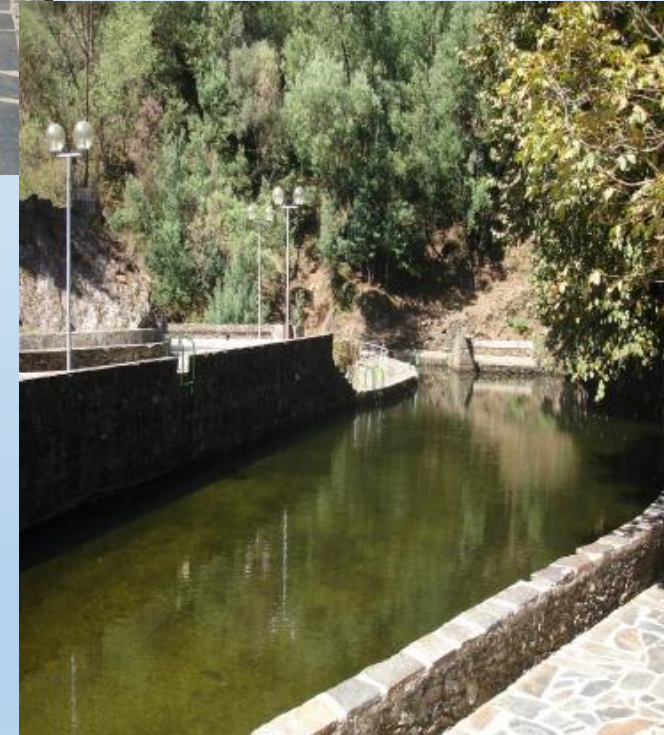
Senhora da Piedade River Beach - Lousã