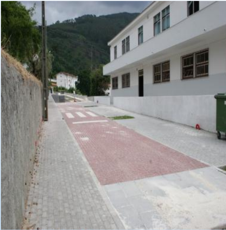
Dr. António Lemos Street - Lousã