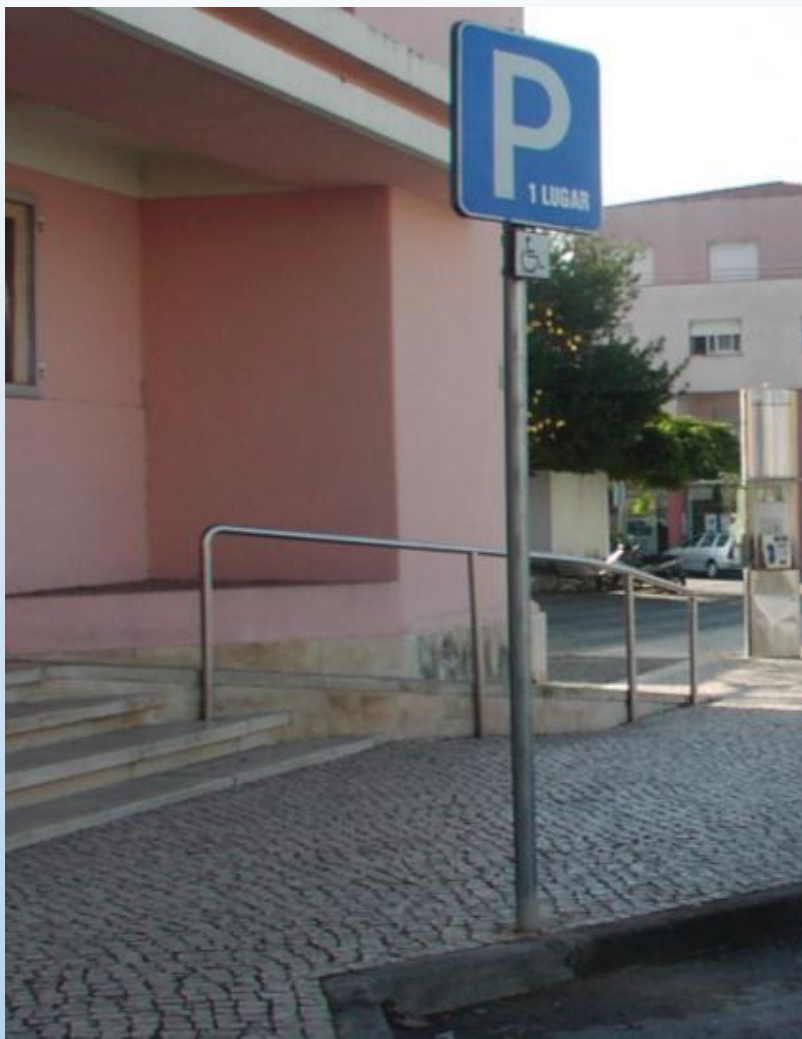
Theatre - Lousã